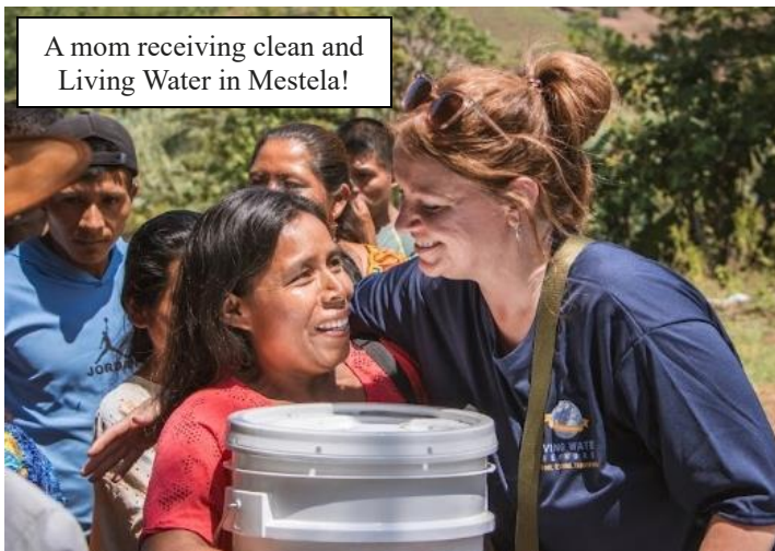
A mom receiving clean and Living Water in Mestela!

You made something incredible happen in a small village nestled in Guatemala, called Mestela. Thanks to the generosity of donors like you to Another Child Foundation (ACF), 84 families received a life-changing gift: water filters!