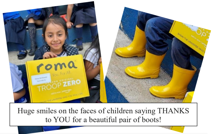
Huge smiles on the faces of children saying THANKS to YOU for a beautiful pair of boots!

Because of you, children in Guatemala now have brand new boots to keep their feet warm and dry. Your support has turned their little steps into big blessings!