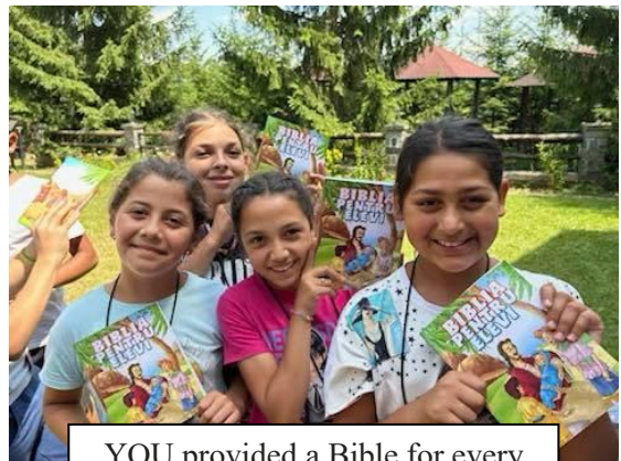
YOU provided a Bible for every child at camp!