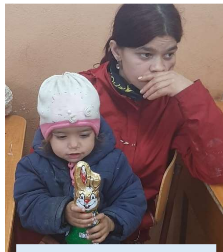
CUTENESS OVERLOAD! A child enjoying her 1st chocolate Easter treat ever!