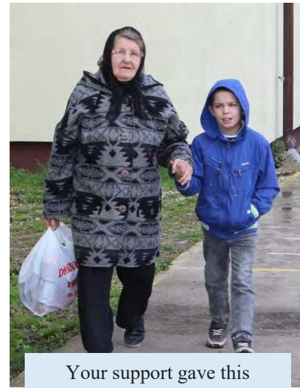
Your support gave this grandma and her grandson the precious gift of food!